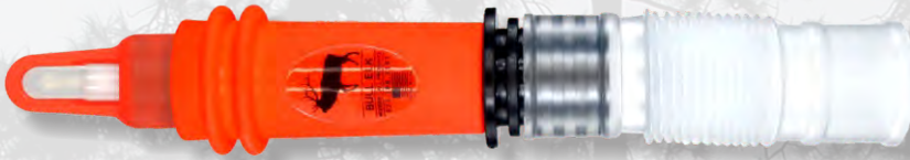
Satellite Sizzler - #304 - $16.50

Cow call produces the mew for both cows & calves: This is a high pitched sound made to each other to bond and communicate a level of safety. Also this call produces Cow Chirps another form of passive herd communication similar to the mew but lower in pitch. The Estrus Scream much louder and high pitched lets the dominant bull she is ready to mate. Lanyard included.