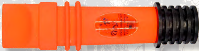
Coon Squaller- #106 - $16.50

Produce aggressive hostile squalls that attract territorial adult males. The bottom loaded sound chamber creates just the right back pressure that gives this system a remarkably rich sound. The sound system has two voice units (Reeds) that play at the same time, professionally tuned creating unnerving sound that brings them to the fight. This style also comes with the Moisture Guard™ Intake Screen that helps to protect against moisture build up and freezing during cold weather calling. Lanyard included.