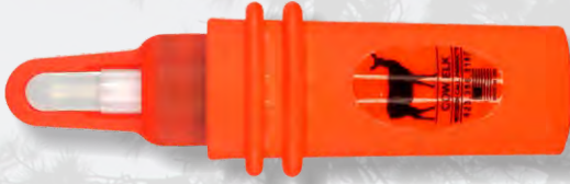
Thriller Cow Call - #303 - $14.50

Cow call produces the mew for both cows & calves: This is a high pitched sound made to each other to bond and communicate a level of safety. Also this call produces Cow Chirps another form of passive herd communication similar to the mew but lower in pitch. The Estrus Scream much louder and high pitched lets the dominant bull she is ready to mate. Lanyard included.